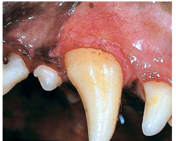
Figure 2: With the gingivoplasty completed, the operator can use a "paintbrush" technique and a triangular electrode to reestablish normal gingival contour

There are a plethora of radiosurgery electrode tips available. The straight wire, loop and ball are the three most commonly used.